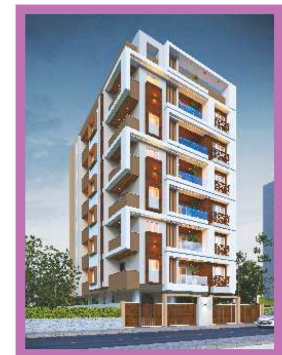
KARAN SUNSHINE SUBHEDAR LAYOUT.